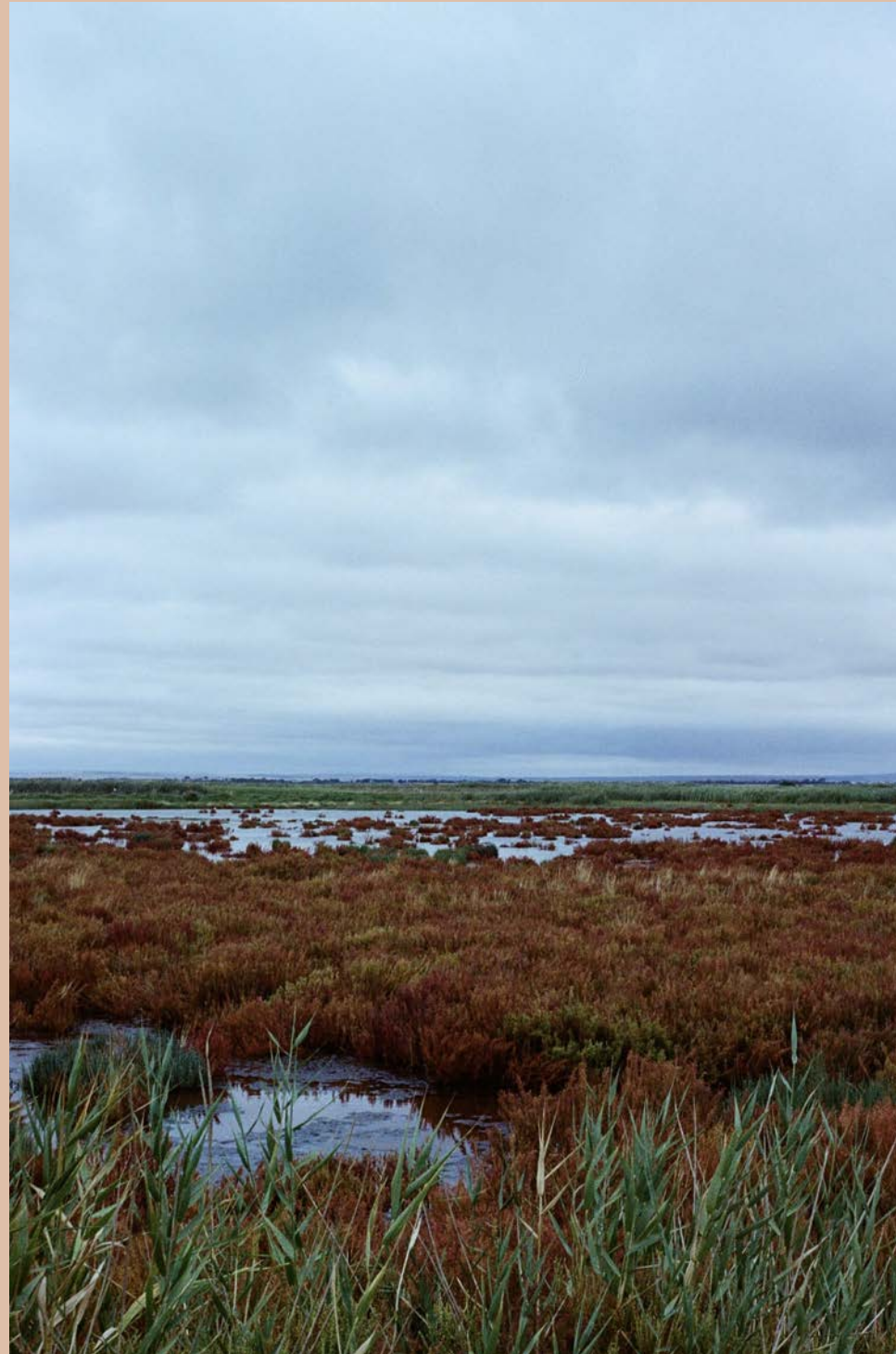
Thultharrung / Tolderol Wetland located on Ngarrindjeri Country