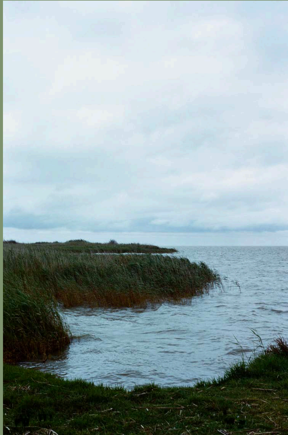
Lake Alexandrina located on Ngarrindjeri Country