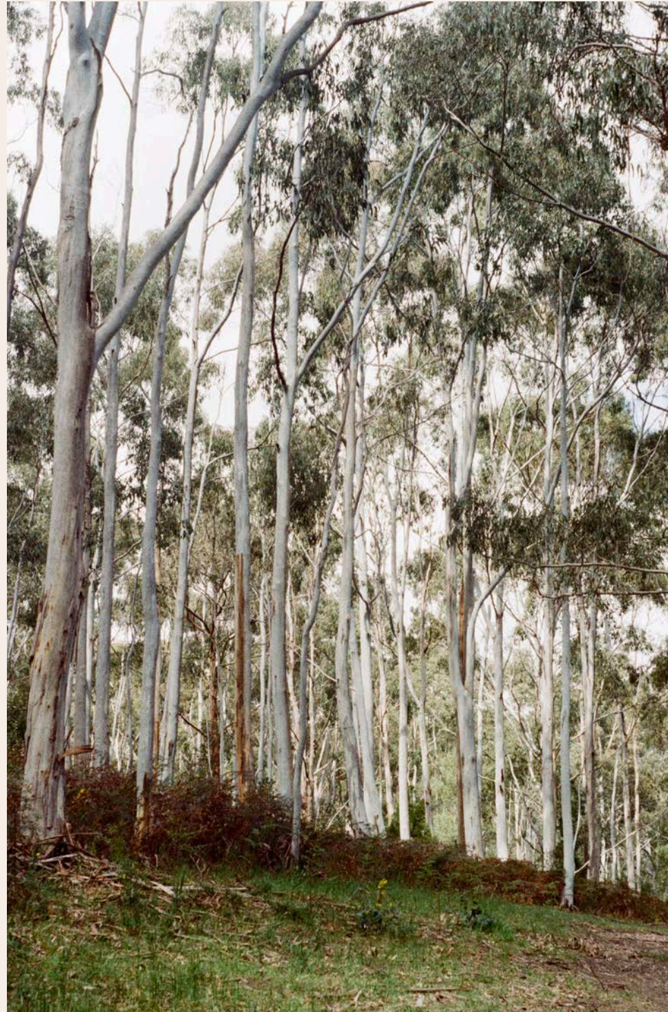
Mount George Conservation Park located on Kurna & Peramangk Country