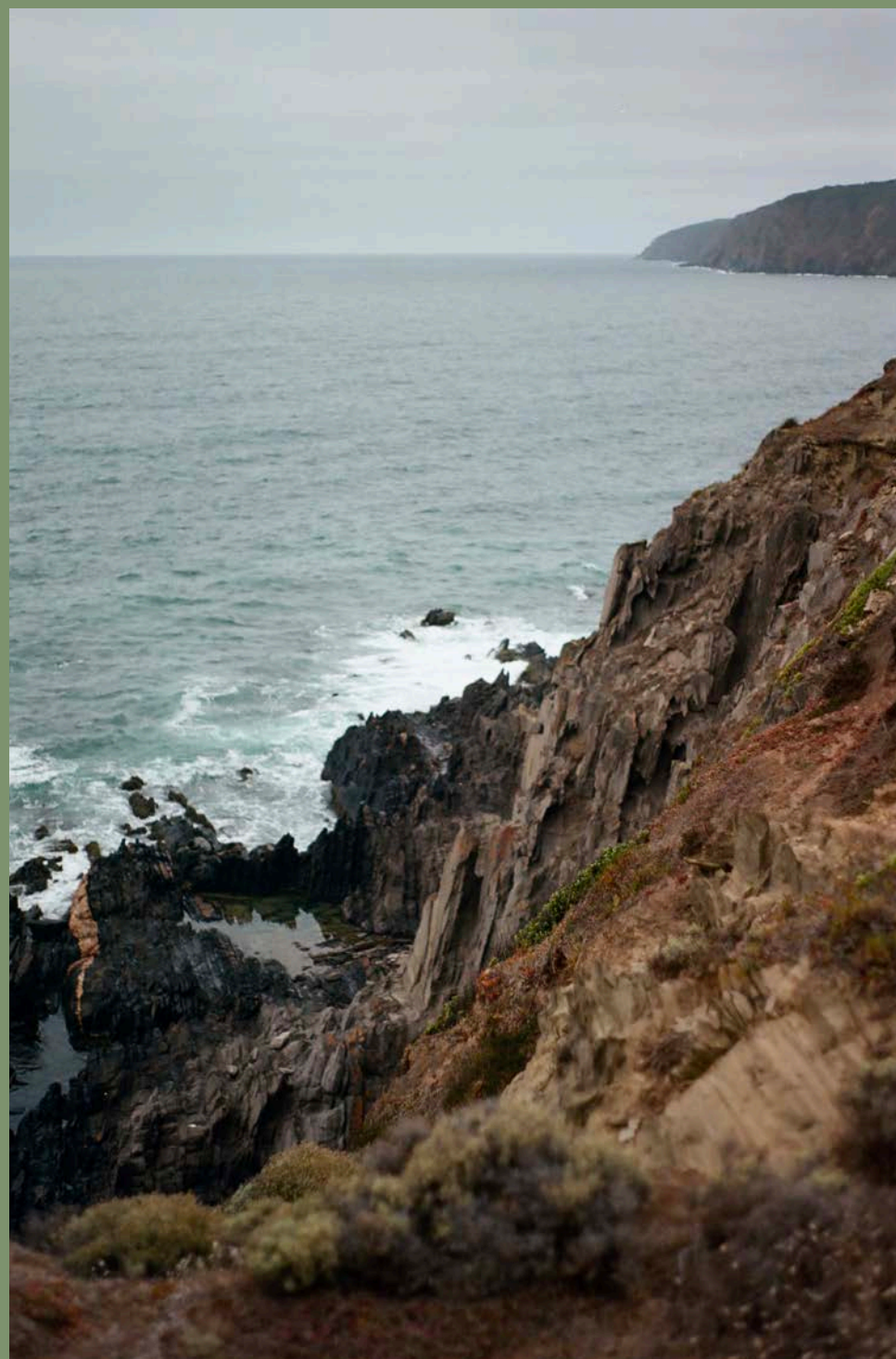
King Head Cliffs located on Ngarrindjeri Country