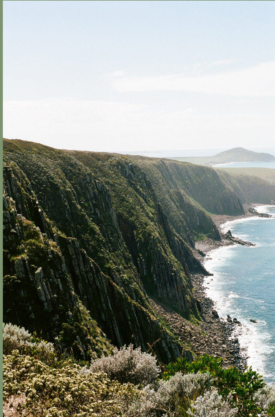
Waitpinga Cliffs located on Ngarrindjeri Country