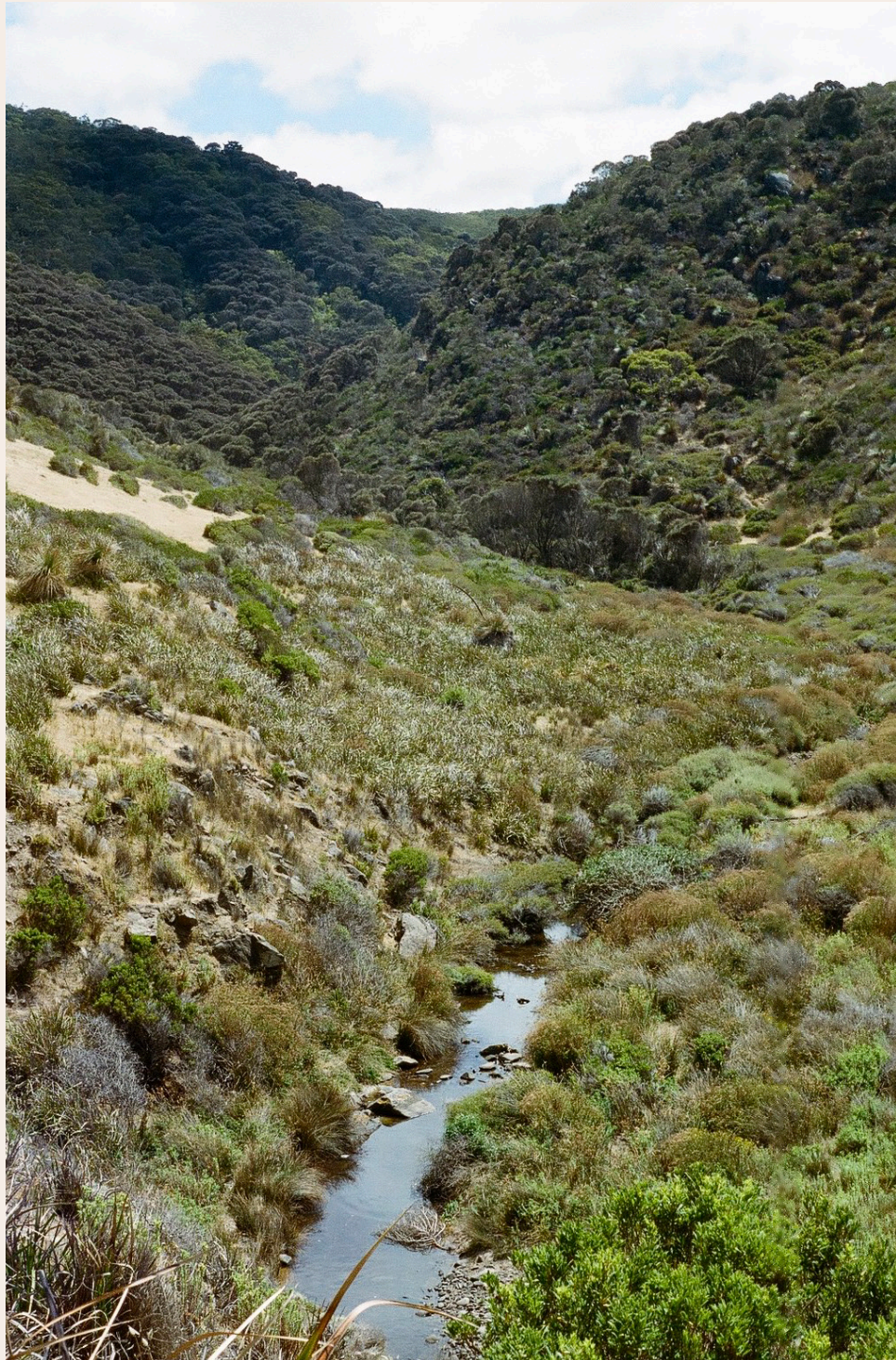
Newland Head Conservation Park located on Ngarrindjeri Country