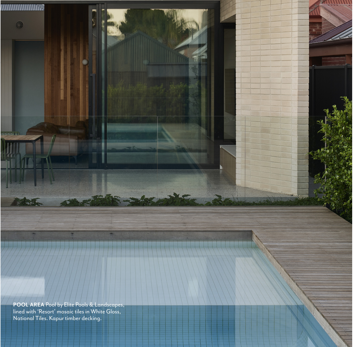
POOL AREA Pool by Elite Pools & Landscapes, lined with 'Resort' mosaic tiles in White Gloss, National Tiles. Kapur timber decking.